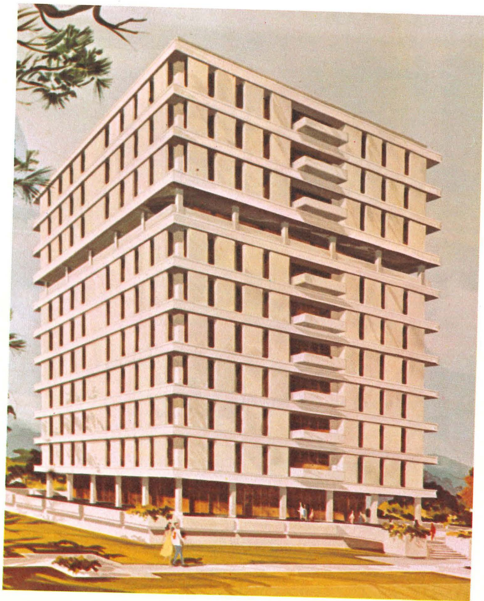
LIBRARY FIRST FLOOR LOUNGE — SITE OF HALL OF FAME